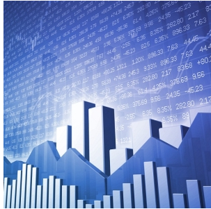
Chart reflects price changes, not total return. Because it does not include dividends or splits, it should not be used to benchmark performance of specific investments.