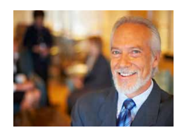
"F.N.B. Wealth Management does an outstanding job of managing my business investments, and that frees me up to focus on growing my business."