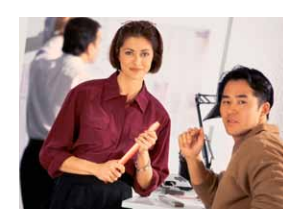
"First National Bank has become a trusted advisor for my business. They're very committed to helping me identify ways to streamline and make the most efficient use of my money."